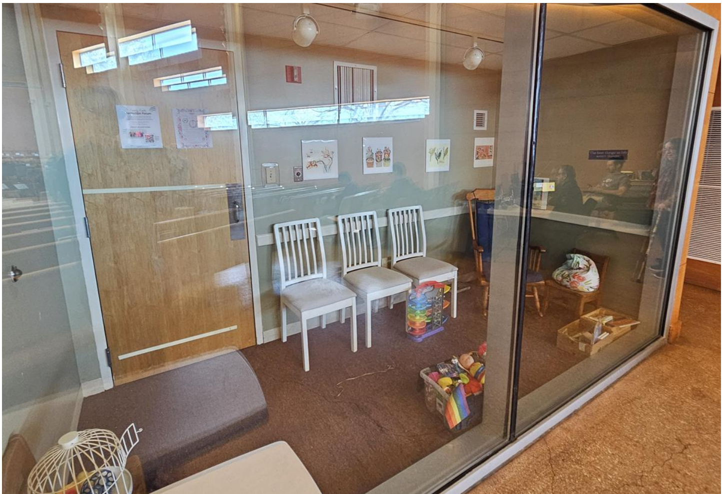
The Wiggle Room, located in the rear of the Sanctuary, is a nearly sound-proof room for optional use by parents of young children.