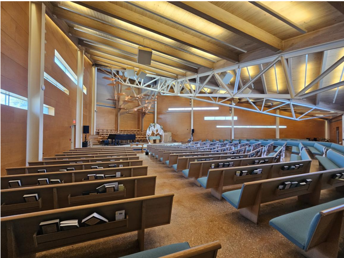
View from left-rear showing nearly all the pews that can accommodate up to 400 people.