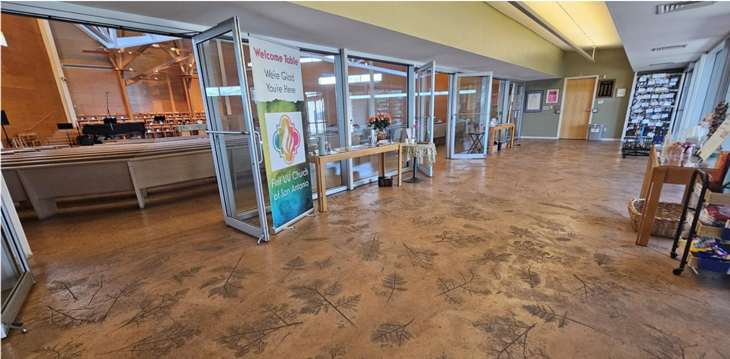
The Sanctuary entrance and foyer. Behind the wooden door at the end of the foyer is our Sanctuary Lounge.