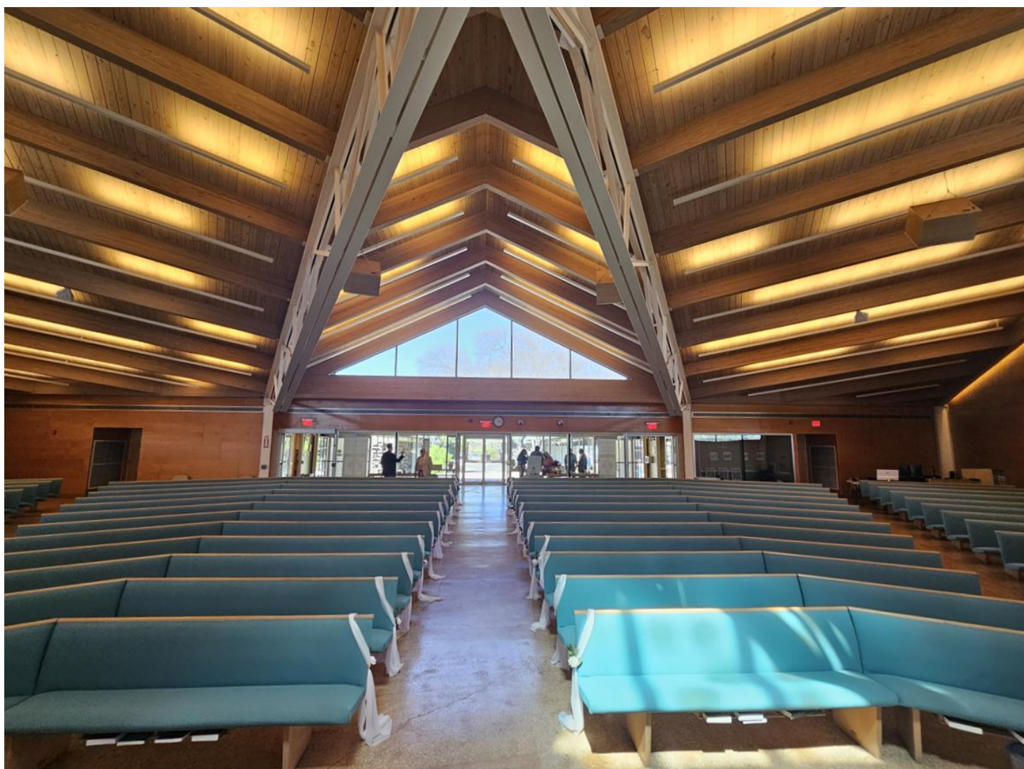
View from the stage to the entrance.