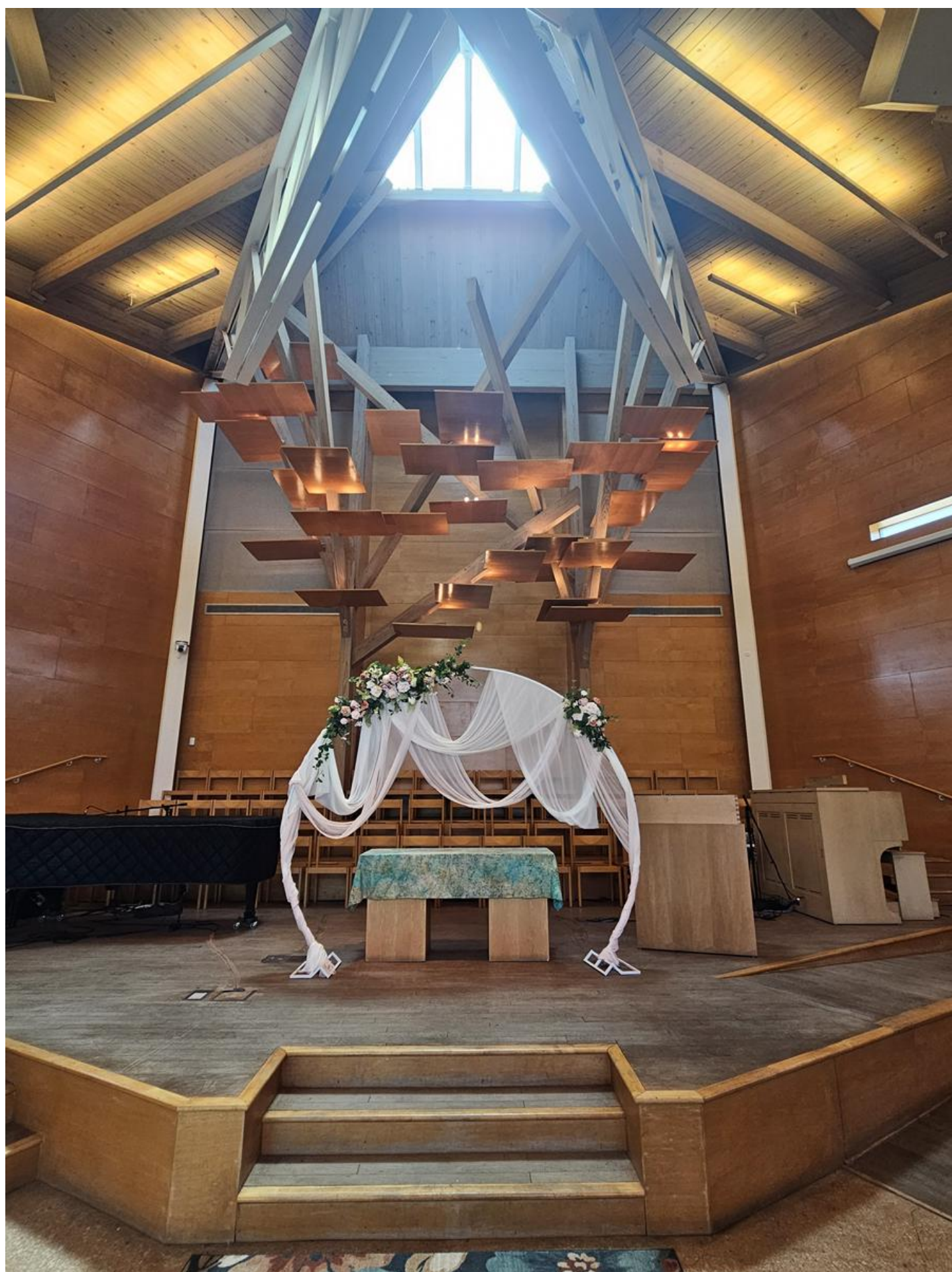
Vertical view of same wedding setup. Here capturing the skylight.