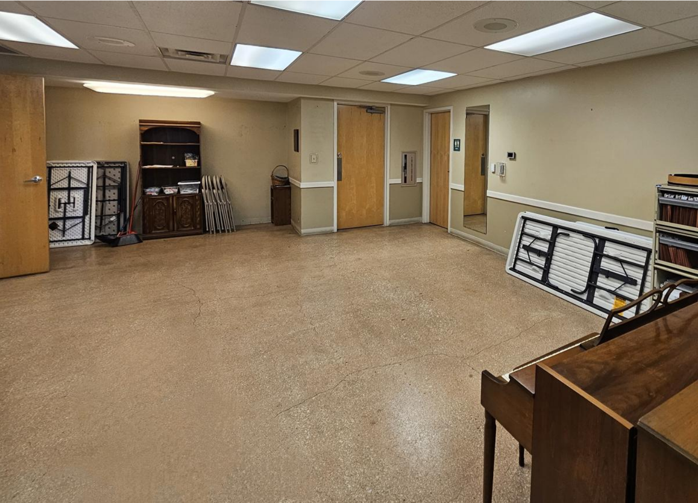
The Sanctuary lounge. This large room is available for the wedding party to relax and prepare before the ceremony.