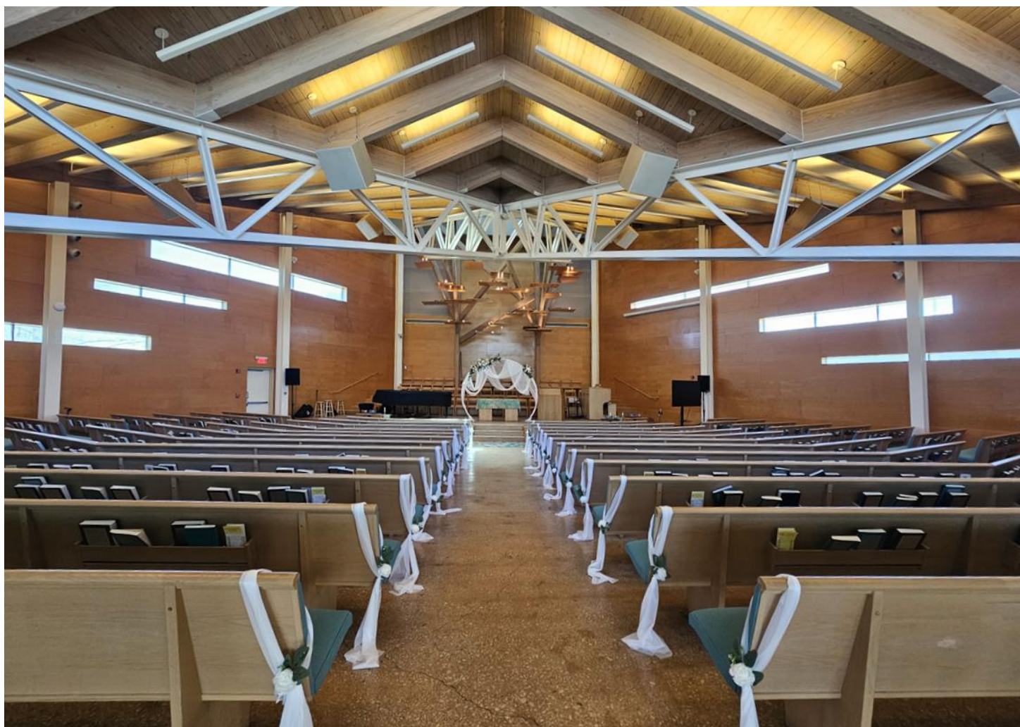
View from the rear of the sanctuary. The decorations at the end of each pew were provided by the wedding party.